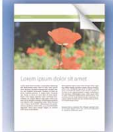
Normal B/W print